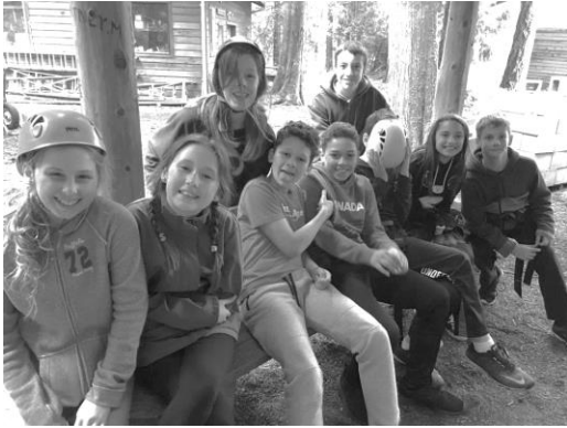
2017 Camp Pringle Music Retreat