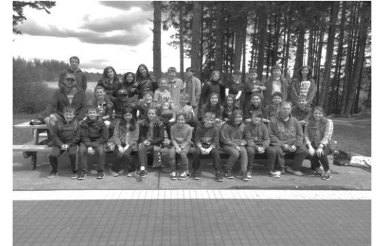
2017 Camp Pringle Music Retreat

Yes. There are lots of ways to get one, including borrowing one from the school for little to no cost, or renting one from a music retailer. Information will be handed out in class about how to get an instrument. No student will be denied an opportunity to be a part of the music program because of costs.